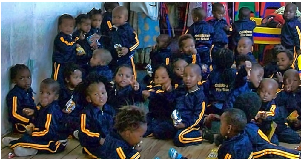
Some of the children of Dalukhanyo Pre-School wearing their new track suits provided by LTPT